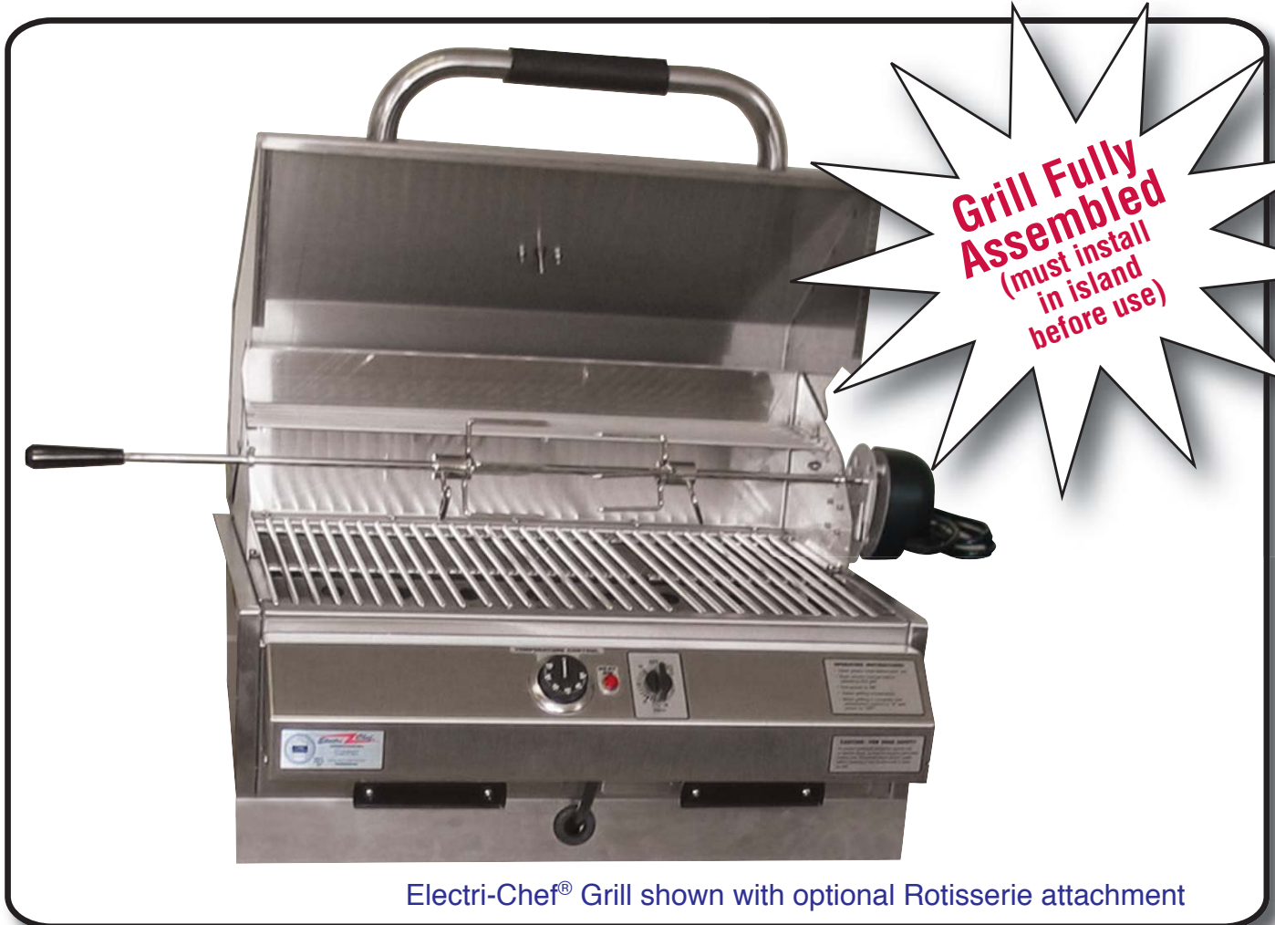
Electri-Chef® Grill shown with optional Rotisserie attachment