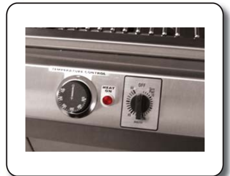
10-60 Minute Timer