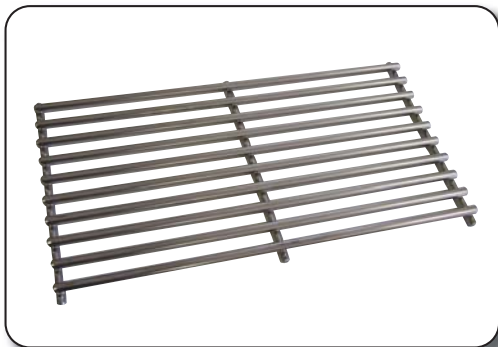
S.S. Cooking Grids